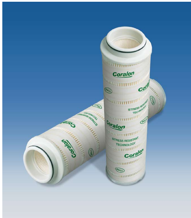
Coralon Filter Elements