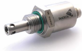
QUALITY SENSOR TAN