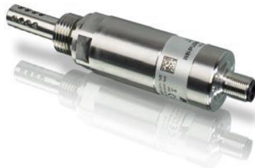
WATER SENSOR PALL