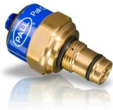
RC222 ANALOGIC DP DEVICE PALL