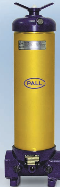
UR699 Series filter housing